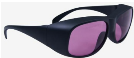
Laser Safety Eyewear